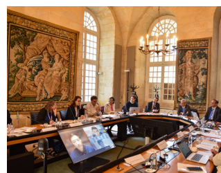
The arrival of parliamentarians from all over the world around the Parliamentarians for Peace, run by the Open Diplomacy Institute with the support of the Normandy Region 2022 Normandy World Peace Forum