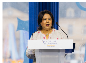
Pramila Patten, UN Special Representative on Sexual Violence in Conflict 2023 Normandy World Peace Forum