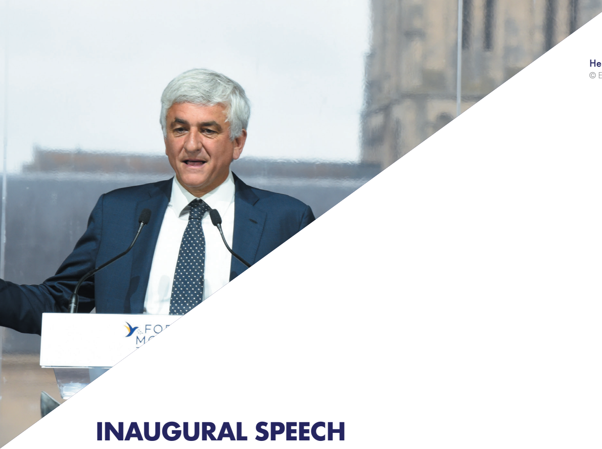
Hervé Morin