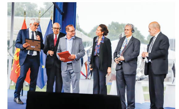
The Minister Jean-Yves Le Drian receiving a copy of the Normandy Manifesto for World Peace