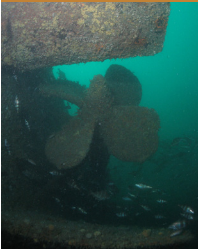
Wreck M39