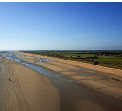
Utah Beach