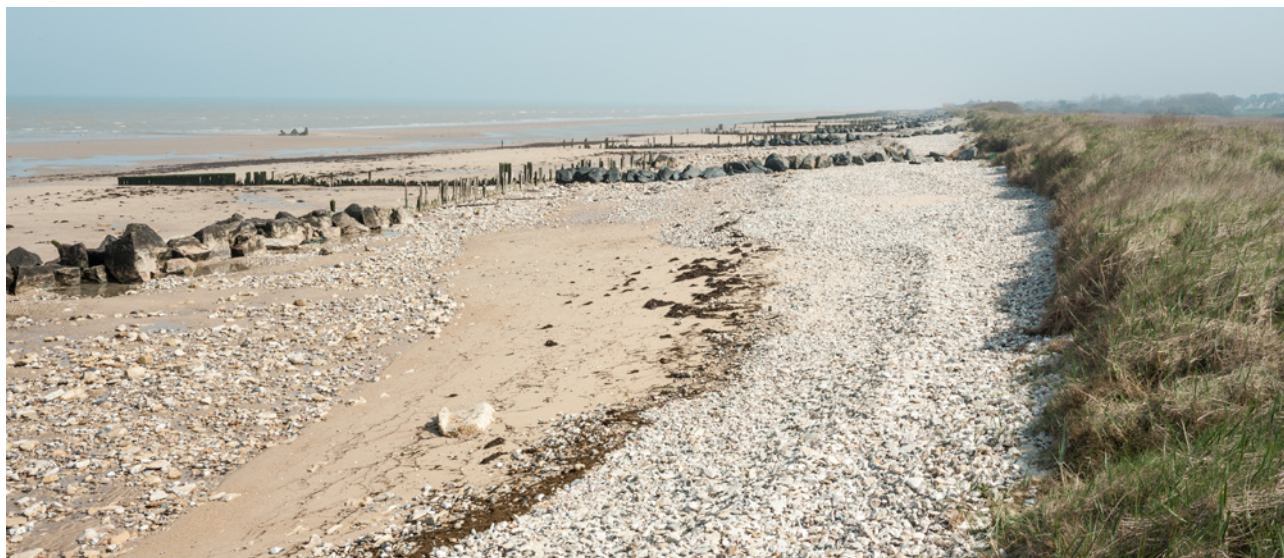
Ver-sur-mer

The culmination of this initiative, the Normandy World Peace Forum , will be launched in 2018 and will be held every year after the June 6, 1944 commemorations. It will be an annual international event devoted to topics related to peace and stability throughout the world.