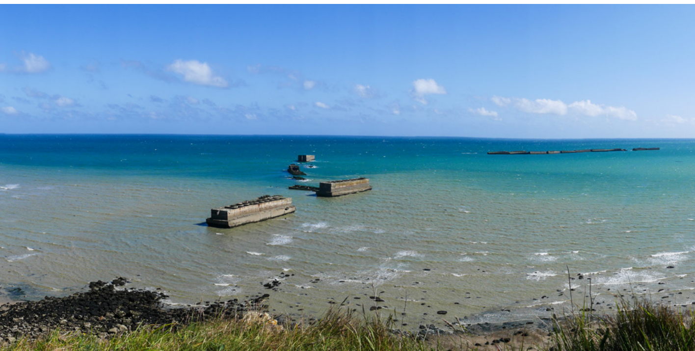
Mulberry B - © François Chandavoine - Septième Ciel Images - Normandy Region